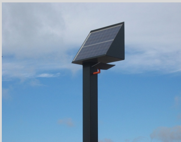
Fig. ORION 70W Architectural Version.

*The autonomy depends on the selection of T1, T2 and the L2 value.